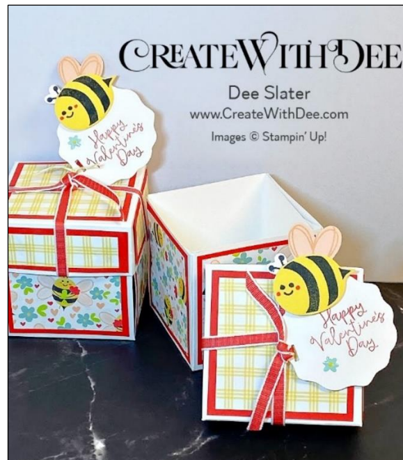
3x3 Box with Lid